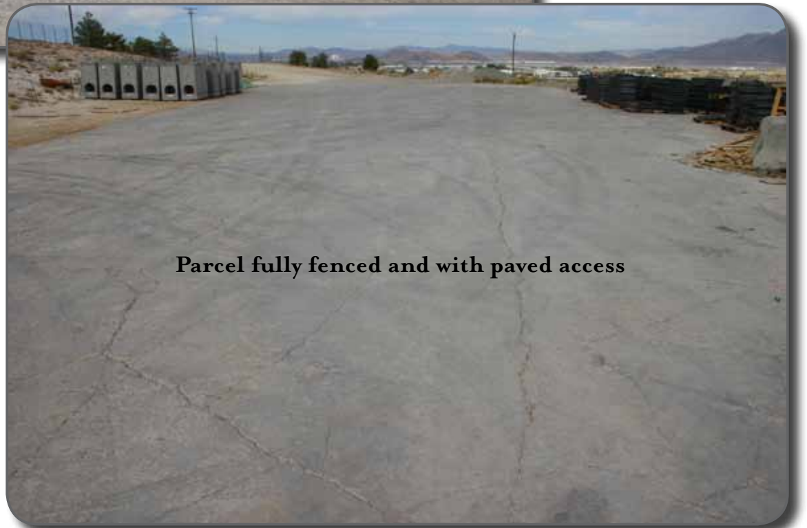
Parcel fully fenced and with paved access