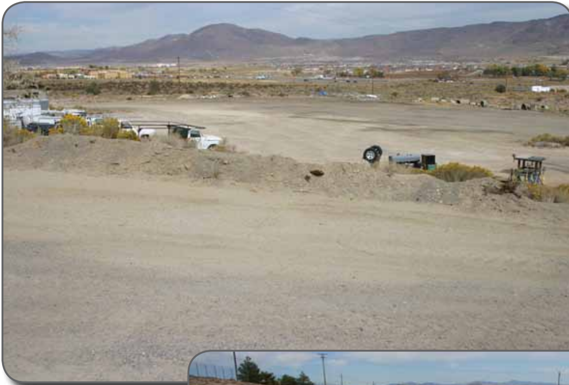
View towards the North with Summit Sierra Mall in background